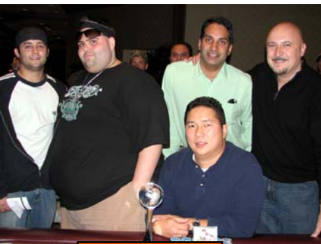
THE TOP FIVE!