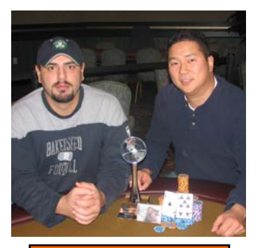
The Final Two