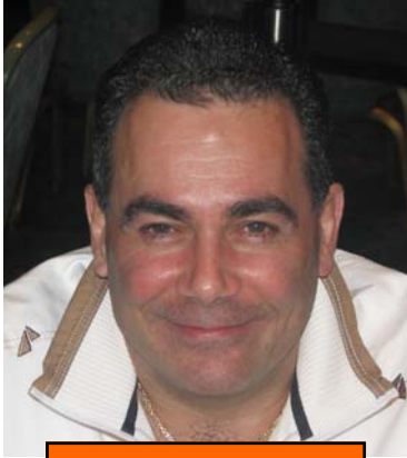
Bobby The Bus - 7th!